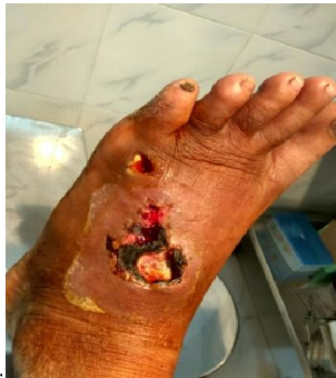
Before I& D: