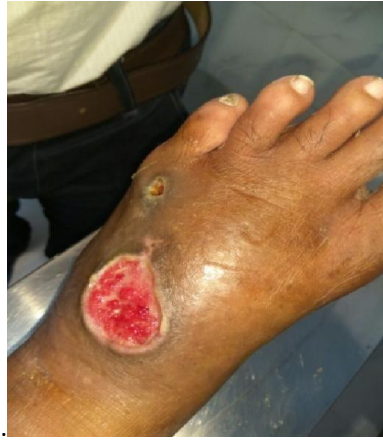
Post op I & D : Day 10 th