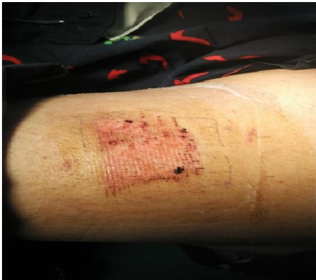
Graft site-Left sided Thigh region. Post Operated-Day 3